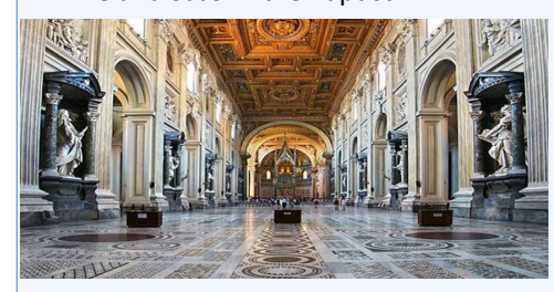
Inside the Lateran Basilica

The Church of St. John is located on the Lateran hill in Rome and is described as the 'Mother and Head of all the churches in the City and the World' (Urbi et Orbi). It is the cathedral church of the Bishop of Rome and was called 'St John' after the two monasteries once attached, dedicated to St John the Divine and St John the Baptist.